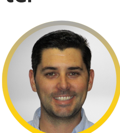
Safety & Health Supervisor Orange County Sanitation District

The VPPPA Safety Star of the Quarter is a program to honor and recognize an employee's achievements in safety performance and professionalism. Help us showcase an exceptional VPPPA member by submitting a nomination today .