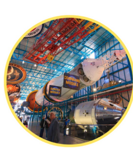
Kennedy Space Center Tour Saturday, September 16

Click here more information and to register.