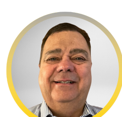
Health and Safety Manager Flint Hills Resources, Corpus Christi, TX

The VPPPA Safety Star of the Quarter is a program to honor and recognize an employee's achievements in safety performance and professionalism. Help us showcase an exceptional VPPPA member by submitting a nomination today .